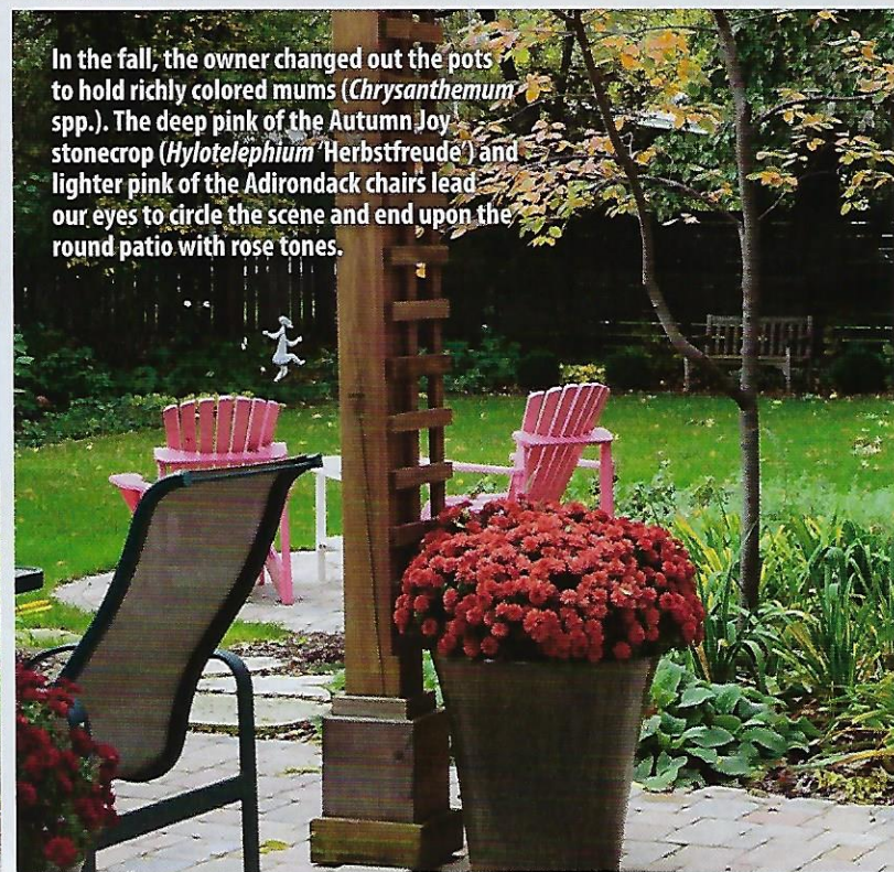
In the fall, the owner changed out the pots to hold richly colored mums ( Chrysanthemum spp.). The deep pink of the Autumn Joy stonecrop ( Hylotelephium 'Herbstfreude') and lighter pink of the Adirondack chairs lead our eyes to circle the scene and end upon the round patio with rose tones.