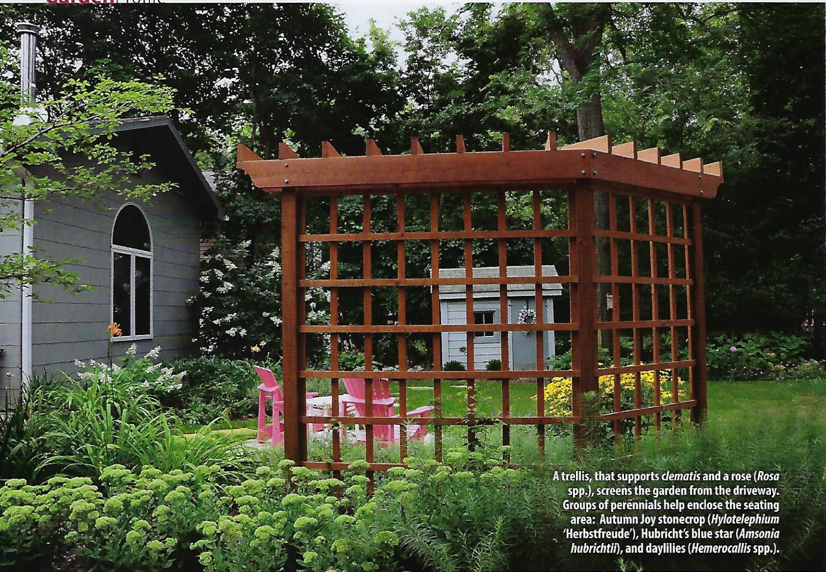
A trellis, that supports clematis and a rose ( Rosa spp.), screens the garden from the driveway. Groups of perennials help enclose the seating area: Autumn Joy stonecrop ( Hylotelephium 'Herbstfreude'), Hubricht's blue star ( Amsonia hubrichtii ), and daylilies ( Hemerocallis spp.).